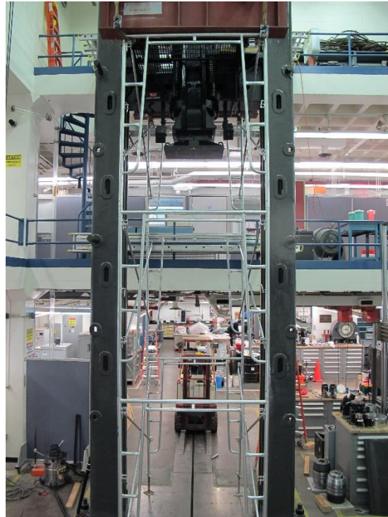
Loading test setup