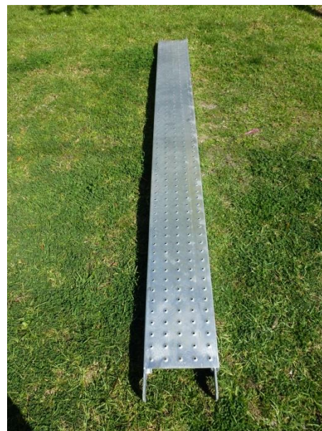
FIG.1 2.4M MODULAR SCAFFOLD PLANK