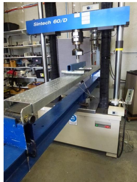
FIG.2 STRENGTH TESTING

As per AS/NZS 1577 CLAUSE C1, modular planks incorporated in a prefabricated modular scaffold such as CORONET Ring Lock Scaffold system need not be tested for sliding performance.